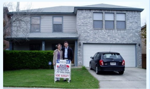
Our first house...Casa de Sharrow

Last year was the great “exodus to Texas,” and this year was one of homesteading as we purchased our first house. We were thrilled to find a home with everything we wanted—living space fit to host small groups and space to have a family (one day). A better part of the spring and early summer was spent removing wall-paper, painting, and getting it ready to settle into. We were blessed to have some friends who spent dozens of hours serving selflessly! God provided so well beyond our expectation through the particular house, location, price, and experiences of ownership.