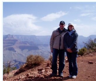
Taking in the Grand Canyon