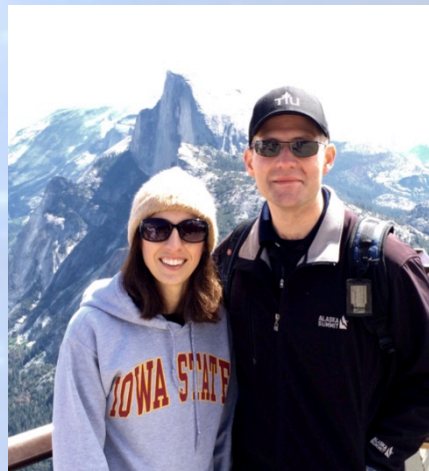
Yosemite was a fantastic trip for us!