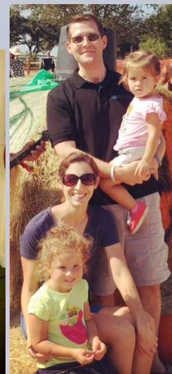
Family fun in the fall