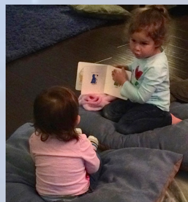
School is in session – they love hanging out together