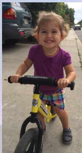
Somebody was VERY proud of herself or herself learning to ride the strider