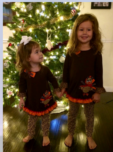
Happy Holidays from some cute turkeys!