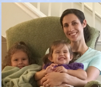
Cuddle time with Momma