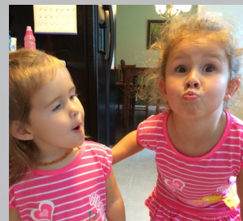
Hard not to smile with these two ☺