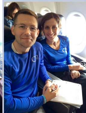
An intentional anniversary trip