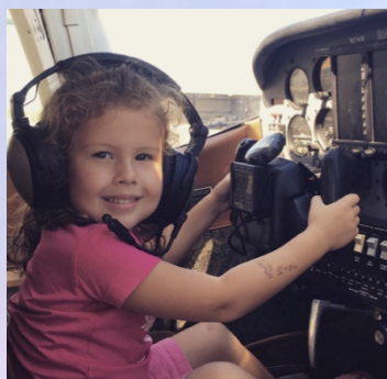
Daddy-Daughter adventure for birthday was flying in the Hill Country!