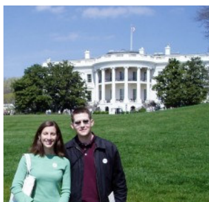
Visiting the summer home in D.C.