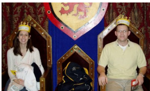
The Royal House of Sharrow? Medieval Times - Schaumburg, IL

One of the hardest aspects of a change from Chicago to San Antonio was the change in churches. We had so many great relationships and experiences with our friends at Village Church of Gurnee (VCG) back in Chicago! Fortunately, we were able to capitalize on some great small group experiences both in and outside of VCG earlier in the year in addition to the youth and children's ministry work. We will certainly miss the rich relationships and look forward to hearing how God continues to use the church throughout the Chicagoland area.