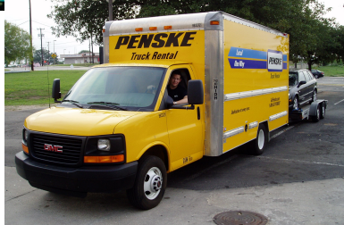
Modern Day Wagon